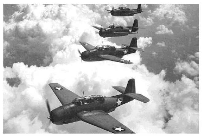
Five U.S. Navy Grumman TBF-1 Avengers from Escort Scouting Squadron 29 flying in formation over Norfolk, Virginia, on September 1, 1942.

The Douglas TBD Devastator torpedo bomber was the U.S. Navy's first allmetal monoplane carrier aircraft, joining the fleet in 1937. However, by 1939, the Devastator was already obsolete. War had raged in China for years as Japan sought to conquer its Asian neighbor. War was looming in Europe as well; Nazi Germany continued to gobble parts of other nations. By most accounts, World War II officially began on September 1, 1939, when Germany invaded Poland. As