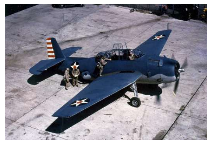
A TBF-1 Avenger early in 1942. Note the red spot centered in the U.S. roundel and flag-inspired fin flash on the rudder, both of which were removed prior to the Battle of Midway to avoid confusion with Japanese insiania.

The Japanese continued to attack Guadalcanal. From November 12 to 14, 1942, the naval Battle of