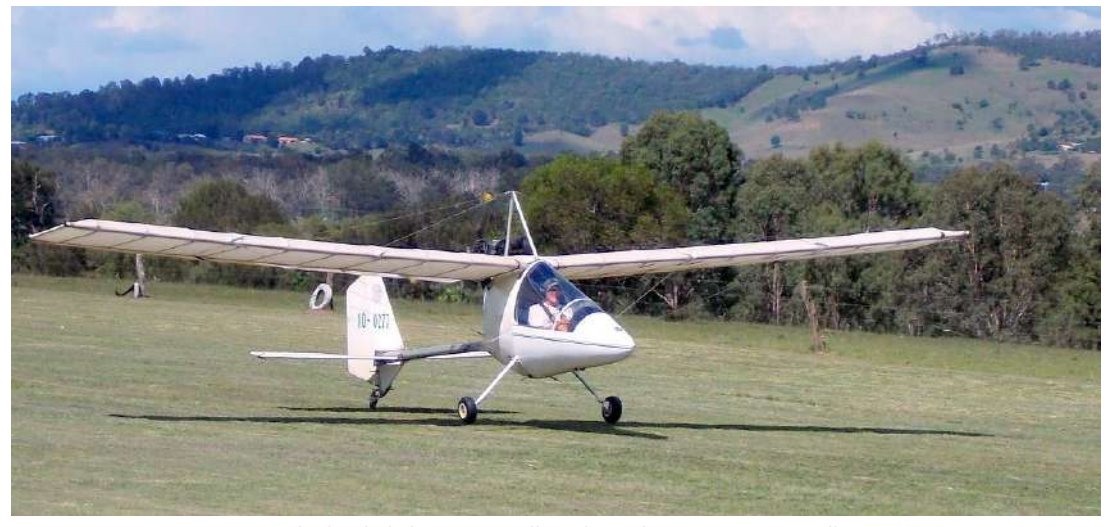
The landed Sky Dart III rolling through at YFRH Forest Hill

A single seat, ultralight, Taildragger. Built in 1987, this aircraft has had a single owner for the past 18 years, and is only now I am regretfully releasing it again for sale. I also have a Teenie II and am building another ultralight so I need the space.