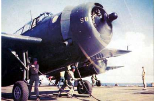
A TBF Avenger ready for catapult launch.

the tail was used to defend against enemy fighters attacking from below or the rear. Later models of the TBF/TBM replaced the cowl-mount .30-caliber gun with twin Browning AN/M2 .50- calibre guns, one in each wing outboard of the propeller arc. These guns gave pilots better forward firepower and increased the airplane's strafing capabilities.