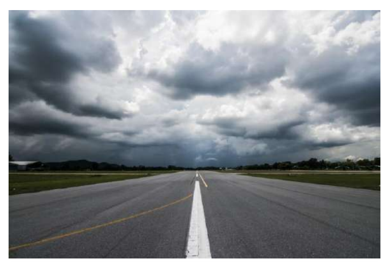
Nearly three decades later, an accident report from a Cessna 177B crash in Wyoming still provides a valuable teaching tool.

This isn't just stunt flying gone bad—it can be a pilot who bows to external pressures such as getthere-itis or makes decisions when compromised by fatigue. Saying