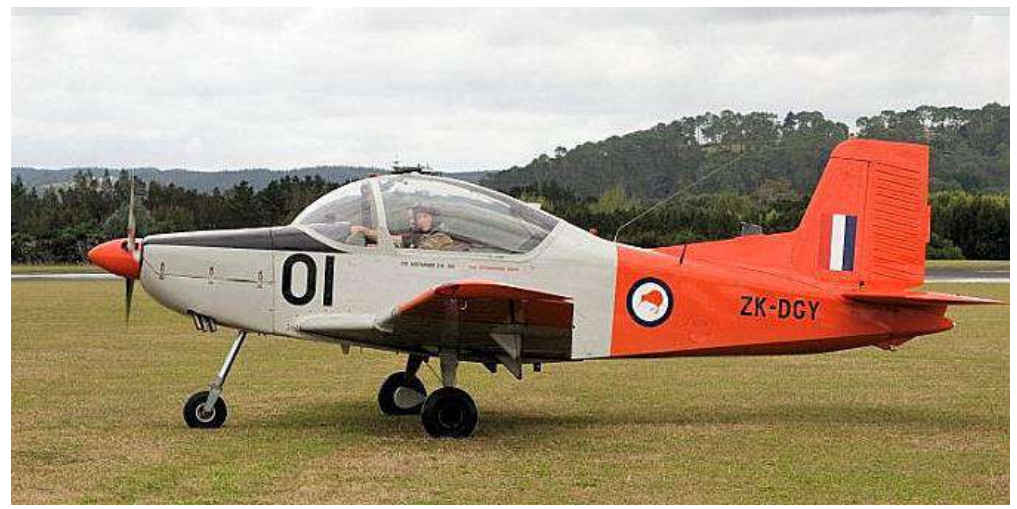
CT4B. ZK-DGY, a great aerobatic trainer