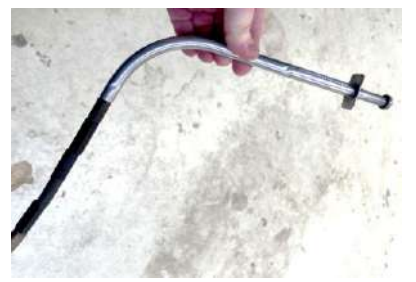
The Victa/Airtourer dip stick

The Victa fuel tank was a rubberised bladder installed beneath the cockpit bench seat and the filler cap was vertical on the starboard fuselage side. This meant that the dipstick had to bend close to 90° so the tip could touch the bottom of the tank for accurate dipping. Therefore, Victa made the stick – it had a handle with a "T" button, placed for one's thumb, attached through a spring and strong cord to the last of about 6 segments, each one reading 5 gallons (imperial). Pressing the button made the string of linked segments go limp and they could be thrust through the open cap on the aircraft's side. When the button was released,