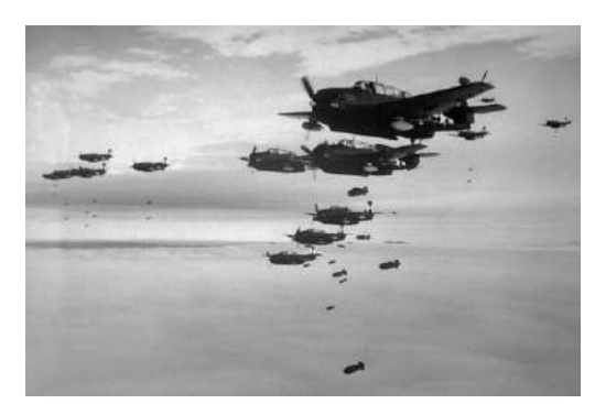
U.S. Navy Grumman TBM-3 Avengers and Curtiss SB2C Helldivers assigned to Carrier Air Group 83 aboard the aircraft carrier USS Essex dropping bombs on Hakodate, Japan, in July 1945.

In 1943, Grumman began to phase out its production of Avengers to manufacture Hellcat fighters. The Eastern Aircraft Division of General Motors, with manufacturing facilities in Maryland, New Jersey, and New York, began to produce Avengers under license (designated TBMs). In mid-1944, production of the TBM-3 began. It was equipped with a more powerful engine and wing hardpoints for drop tanks and rockets.