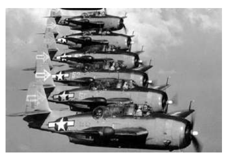
Seven Grumman TBM-3D Avenger bombers of night torpedo squadron VT(N)-90 flying in formation in January 1945. The squadron was part of Night Air Group 90 on the carrier USS Enterprise. Note the radar pods in right-side wings, and the distinctive tail insignia.

In total, 9,836 Avengers were built. Grumman manufactured 2,290 TBFs before production ended, while General Motors produced 7,546 (2,882 TBM-1s and 4,664 TBM-3s).