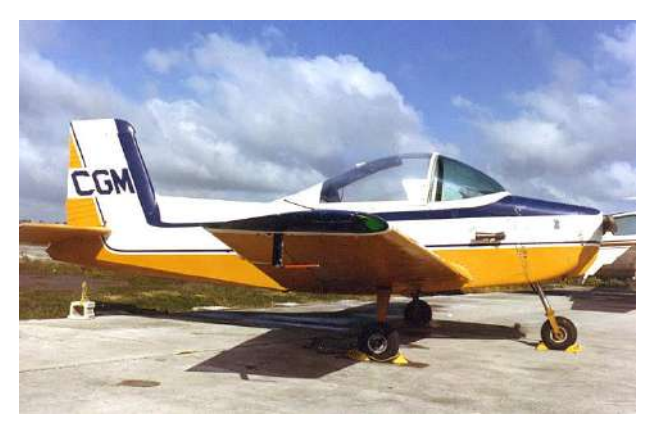
Victa 100 ZK-CGM S/N 55, Built in Australia, flown in New Zealand

The manufacturing rights to the Airtourer were purchased the following year by the New Zealand