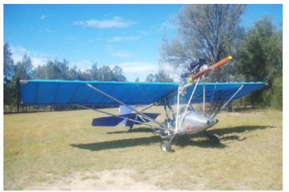
The aircraft at Kentville

to good Pilot. Built in 1984, this is a reluctant sale as I inherited Skyranger V Max and two aeroplanes are too many for me.