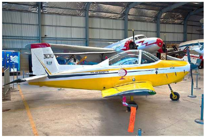
ZK-CXU, MOTAT, Auckland New Zealand

87 aircraft, in July 1973. Rights to produce the Airtourer were then on -sold to Edge Aviation back in Australia. Edge rebuilt a single AESL aircraft but to date there has been no further production of the type.