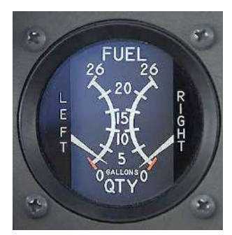
A two-tank fuel gauge. It states that it reads in gallons, but are they US or Imperial. The difference could be a matter of more than a little consequence to those on board. Note: 10 x US Gallons = 27.2kg 10 x Imp Gallons = 32.7kg

Another fuel gauge issue that besets pilots is mentally registering the actual values indicated in the gauge readings. Gauge indications can be in fractions, Imperial gallons, US gallons, pounds and/or